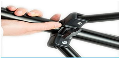
Open the lamp holder

quick installation , easy use and installatiocan be done in a few steps