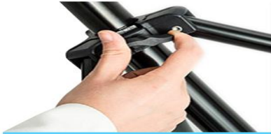
Tighten sliding seat knob of lamp holder