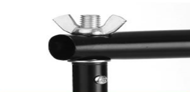
Fix the ends of the crossbar on the lamp holder